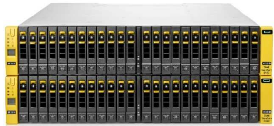
HPE 3PAR StoreServ 8000 Storage (4-Node Storage Base)