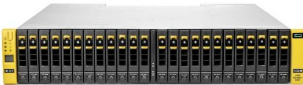
HPE 3PAR StoreServ 8000 Storage (2-Node Storage Base)

HPE 3PAR StoreServ 8000 is storage made effortless.