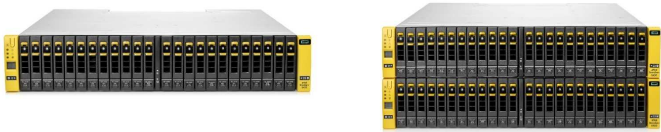
HPE 3PAR StoreServ 8000 SFF(2.5in) SAS Drive Enclosure HPE 3PAR StoreServ 8000 LFF(3.5in) SAS Drive Enclosure