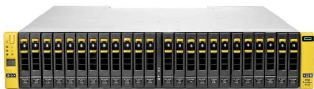
HPE 3PAR StoreServ 8000 Storage (2-Node Storage Base)

HPE 3PAR StoreServ 8000 is storage made effortless.