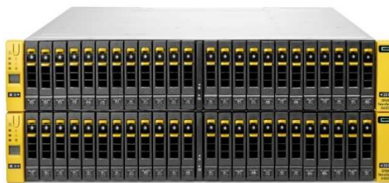
HPE 3PAR StoreServ 8000 Storage (4-Node Storage Base)